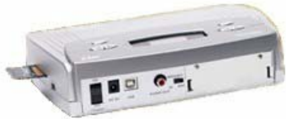
Suitable for desk top or wall mounting 230x180x55mm

With no contract commitments you remain in complete control and decide exactly when to change.