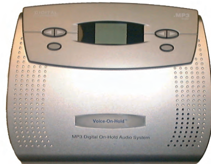
Digital Audio Promotion System